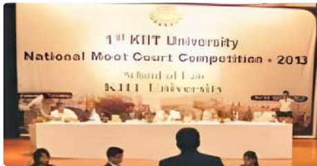
1st KIIT National Moot Court Competition, 2013