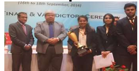
4th KIIT National Moot Court Competition, 2016