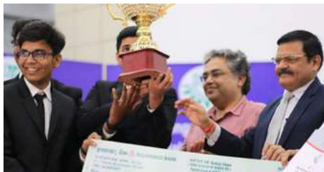
6th KIIT National Moot Court Competition, 2018