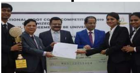
7th KIIT National Moot Court Competition, 2019