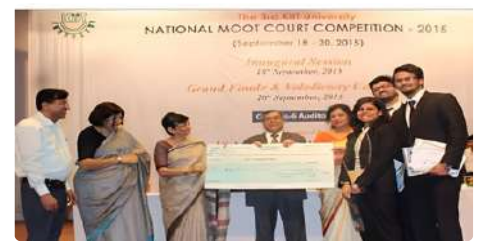
3rd KIIT National Moot Court Competition, 2015