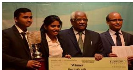
5th KIIT National Moot Court Competition, 2017