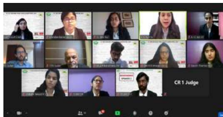
8th KIIT National Moot Court Competition, 2021