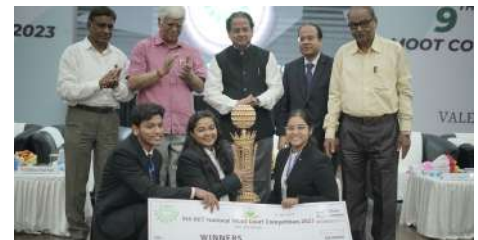
9th KIIT National Moot Court Competition, 2023