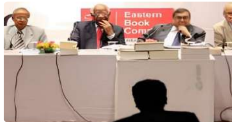
2nd KIIT National Moot Court Competition, 2014