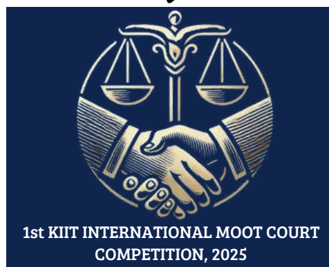
1st KIIT INTERNATIONAL MOOT COURT COMPETITION, 2025